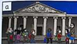
The Big Night starts at half past six.