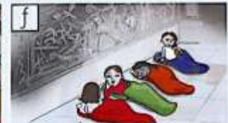
Bedtime is at