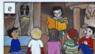
Story time is at