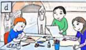
Art is at