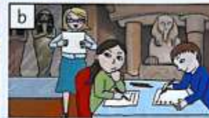
The quiz is at