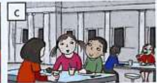
Dinner is at