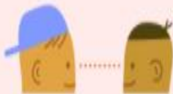
6. Making eye contact