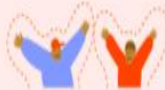
5. Respecting personal space