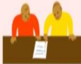
4. Following directions