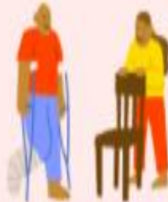
7. Using manners