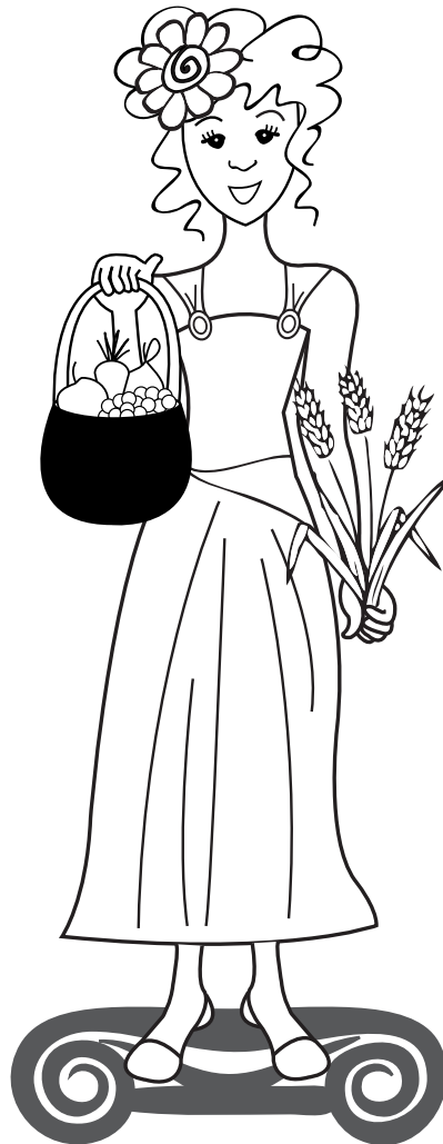
Goddess of the Earth.